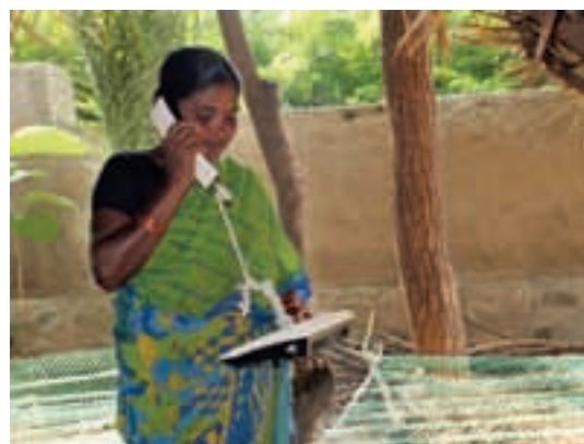
Telephones open up access to new markets